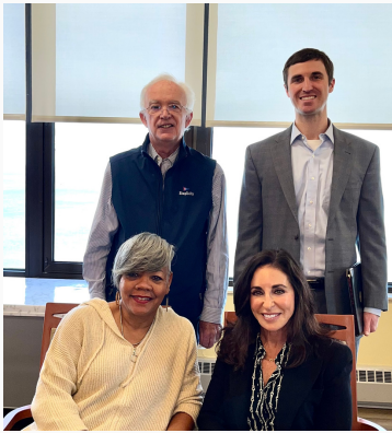
Our New Board Members 2023