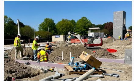
HHHR Construction site